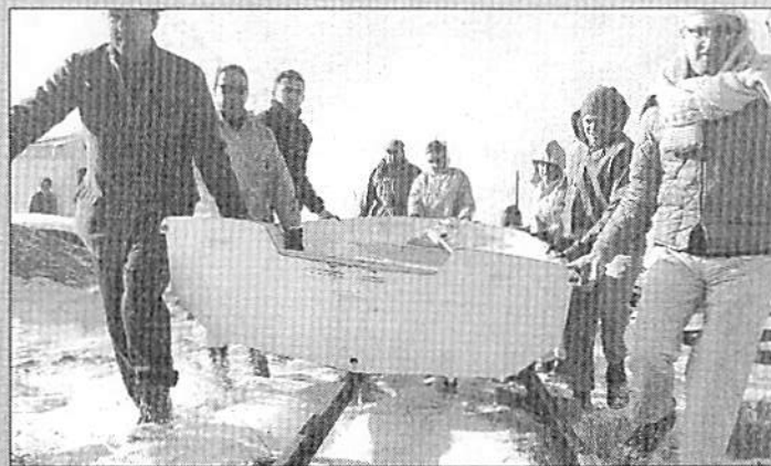
Winter Fun — In February 1965 a group of hardy frostbiters prepare to launch an Interclub Dinghy